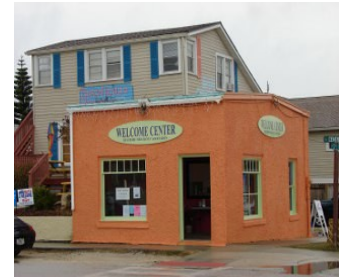
New Welcome Center at Flagler Beach

Be on the lookout for a job fair for interested applicants for Friends of AIA in April.