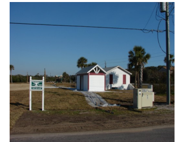
New Welcome Center at Windswept Acres Beachfront Park in St. Johns County